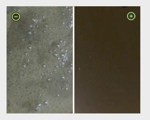
Improved pig farming and manure Homogeneous liquid manure, odour reduction and reduced mortality