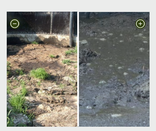
Strong floating crusts Dissolving of floating crusts and elimination of strong odour