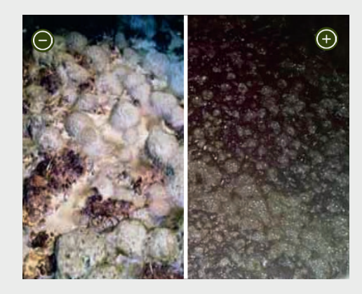
Thick fertilizer sludge and a putrid smell Dissolution and improvement after 1 year of Penergetic use